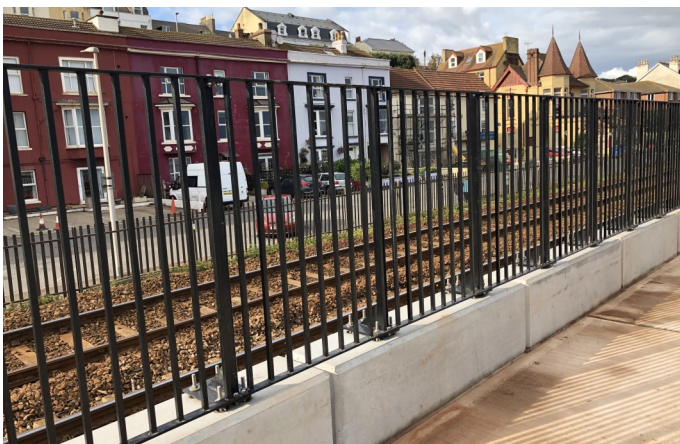
Work on the fencing and granite paving should be completed in October.

Work on the granite paving at the viewing platform and fencing installation will continue over the next couple of weeks, but this can be done without having to close the path again.