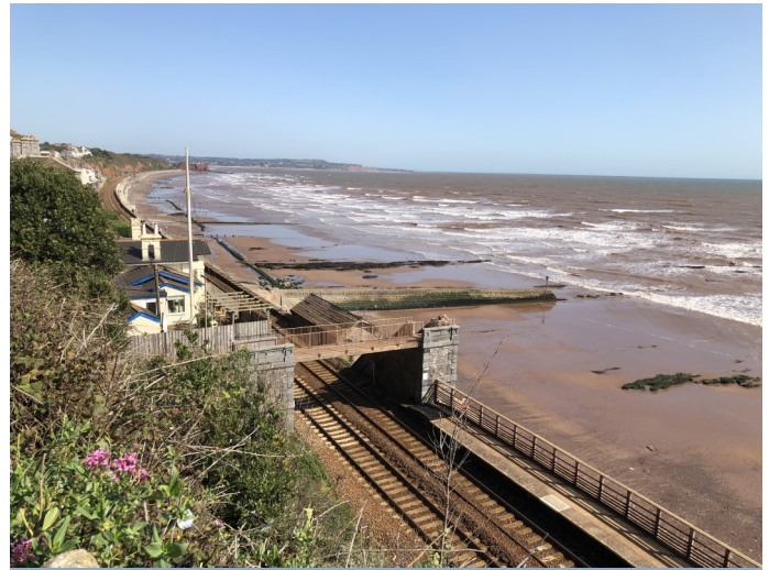
The next stage of the project will run for 415m, up to Coastguards breakwater.

The closures were put in place to allow us to carry out some further work on installing the granite paving at the viewing platform and Boat Cove, including the area around the